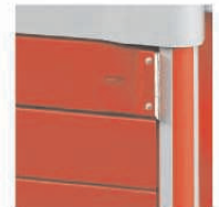
First drawer only