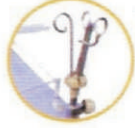
IV pole (option)