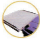
Defibrillator shelf (option)