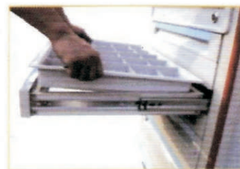
Drawers are easily repositioned without tool (Ball-bearing rail)