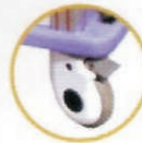
Four 5" wish wheels (two with locking break)