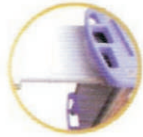
Sliding side shelf