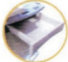
Sliding side drawer